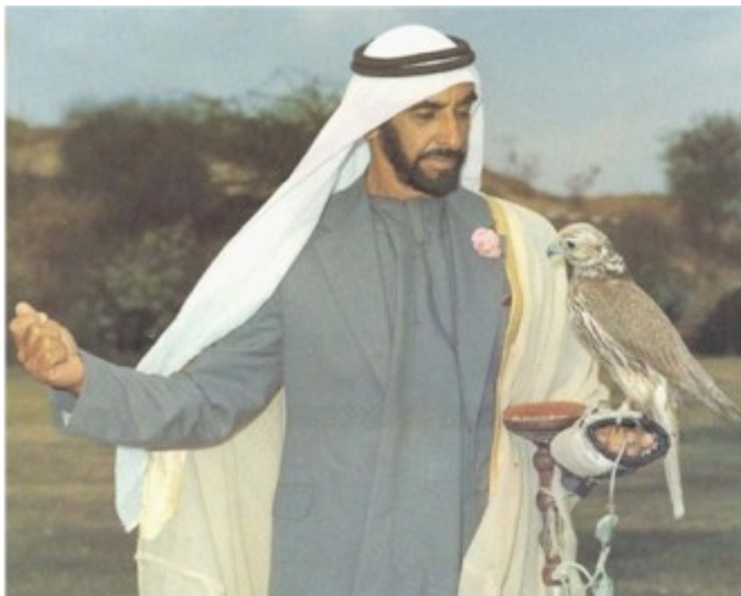
The late Sheik Zayed bin Sultan al-Nahayan of the UAE