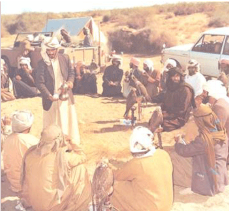
A falcon hunting camp in Afghanistan