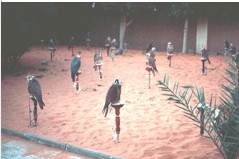
A multi-million dollar collection of falcons belonging to a Gulf Sheik