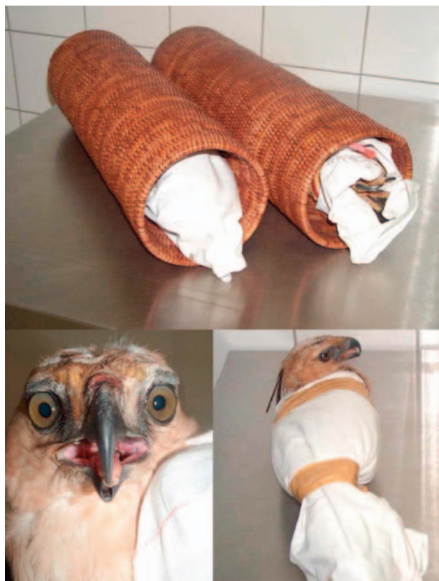
Figure 1. Crested Hawk-Eagles confiscated at Brussels International Airport in the hand luggage of a Thai passenger. The birds were wrapped in a cotton cloth, with the heads free, and each of them inserted in a wicker tube ≈60 cm in length, with 1 end open.

Necropsy and further testing were carried out at the Veterinary and Agrochemical Research Centre (virologic procedures according to EU Council Directive 92/40/EEC of 19 May 1992). Both eagles had enteritis, and 1 had bilateral pneumonia. Samples were taken from lungs and injected into embryonating eggs, which died in <2 days. The isolated virus was denominated A/crested eagle/Belgium/01/2004. The antigenic subtyping as H5N1 was made by hemagglutination inhibition using 12 mono-specific polysera. The diagnosis was confirmed by nucleoprotein gene (general for type A influenza) and H5-specific reverse transcriptase–polymerase chain reaction (RT-PCR) (primers summarized in Table). Sample quality was controlled by using 18S rRNA as housekeeping control gene